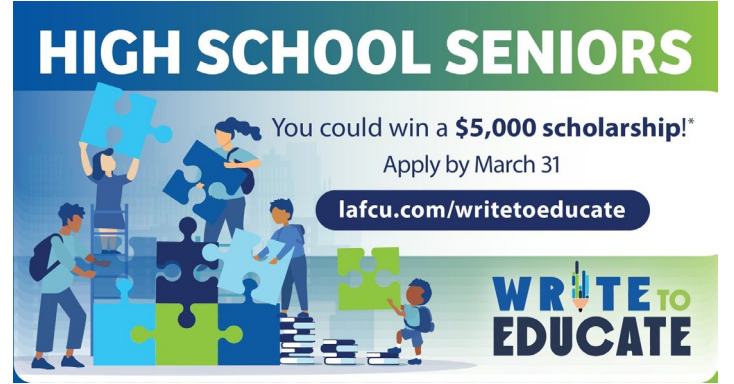
$5,000 will be awarded to four Michigan high school seniors, with an additional $500 donated to a charity of their choice, for a total of $22,000 in donations from LAFCU.

$20K in college scholarships available for Michigan high school seniors