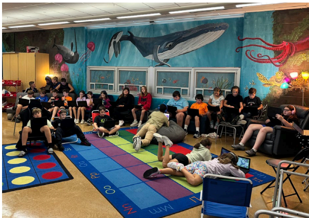
Perry Upper Elementary students explore STEM projects in a dynamic classroom featuring a vibrant undersea mural, made possible by the LAFCU LIFE grant. Cozy seating, like bean bags and cushioned chairs, adds to the engaging learning atmosphere.

LAFCU is awarding a $10,000 grant to one Michigan school to support essential improvements and enhance the learning environment.