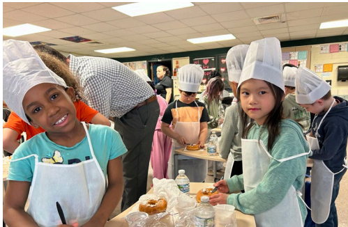
Students at Winans Elementary, dressed in baker attire, decorate their donuts with icing during LAFCU's Listen & Learn—All About Donuts event, combining creativity with financial literacy.