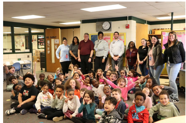
LAFCU's Listen & Learn—All About Donuts event was a collaborative effort with Quality Dairy and first-grade classes at Winans Elementary School, designed to make financial literacy engaging and enjoyable through a hands-on, interactive experience.

the reading, students eagerly lined up to receive their own bakers hats and aprons, getting into character as little bakers. To reinforce financial literacy concepts, each child received a pretend quarter to use for purchasing their donut. With their “payment” complete, they collected all the necessary supplies before diving into the fun of decorating their treats with colorful frosting and sprinkles.