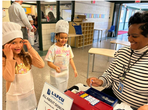
First grade students at Winans Elementary step up to the register to "pay" for their donuts, gaining hands-on financial experience, before decorating their sweet treat.