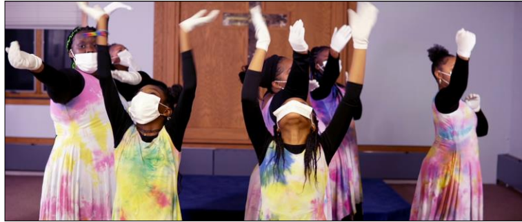
A dance by the Worship Without Words troupe will help celebrate the legacy of Dr. Martin Luther King, Jr. and encourage engaged reading.

National Anthem” because of its deep history of Black pride that speaks to the universal human condition; originally written as a poem in 1899.