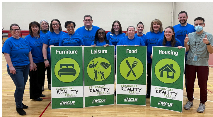
LAFCU team members are all smiles after the March 21 Financial Reality Fair, which helped Perry High School students learn important financial information in an engaging and fun way.

Chartered in 1936, LAFCU is a not-for-profit financial cooperative open for membership to anyone who lives, works, worships or attends school in Michigan and to businesses and other entities located in Michigan. The credit union serves more than 74,000 members and holds over $986 million in assets. It was named a Best Credit Union to Work For in 2020. LAFCU offers a comprehensive range of