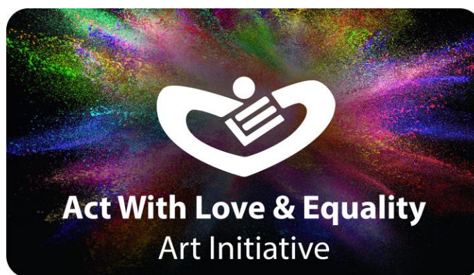
The call for entry is open for LAFCU’s Act with Love & Equality art initiative that will feature artwork by Michigan residents.